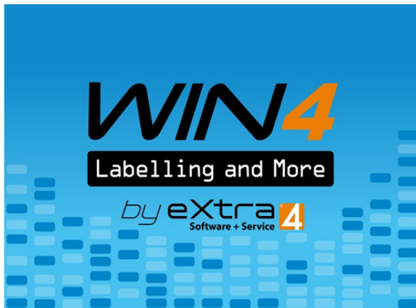
Fig.1: The new brand identity for the main release eXtra4-win4.